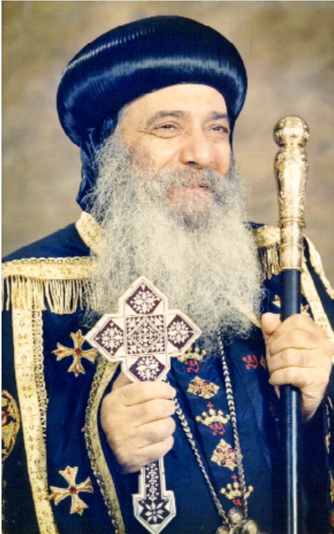
H.H. Pope Shenouda III, 117th Pope of Alexandria and the See of St. Mark